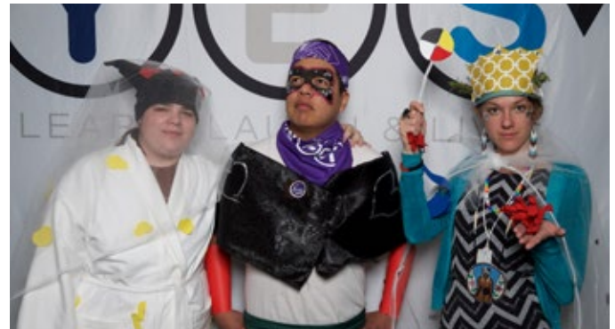
Photo (above): 2017 Symposium Super Hero Challenge! Teams were given a bag of materials, supplies and 90 minutes to create a super hero.

Registration is open! Any Delegates who secure their own Sponsor will be entered into a $1000 cash prize to be drawn at YES 2018! If you are interested in becoming a delegate or a sponsor, please visit YES2018.ca for more information.